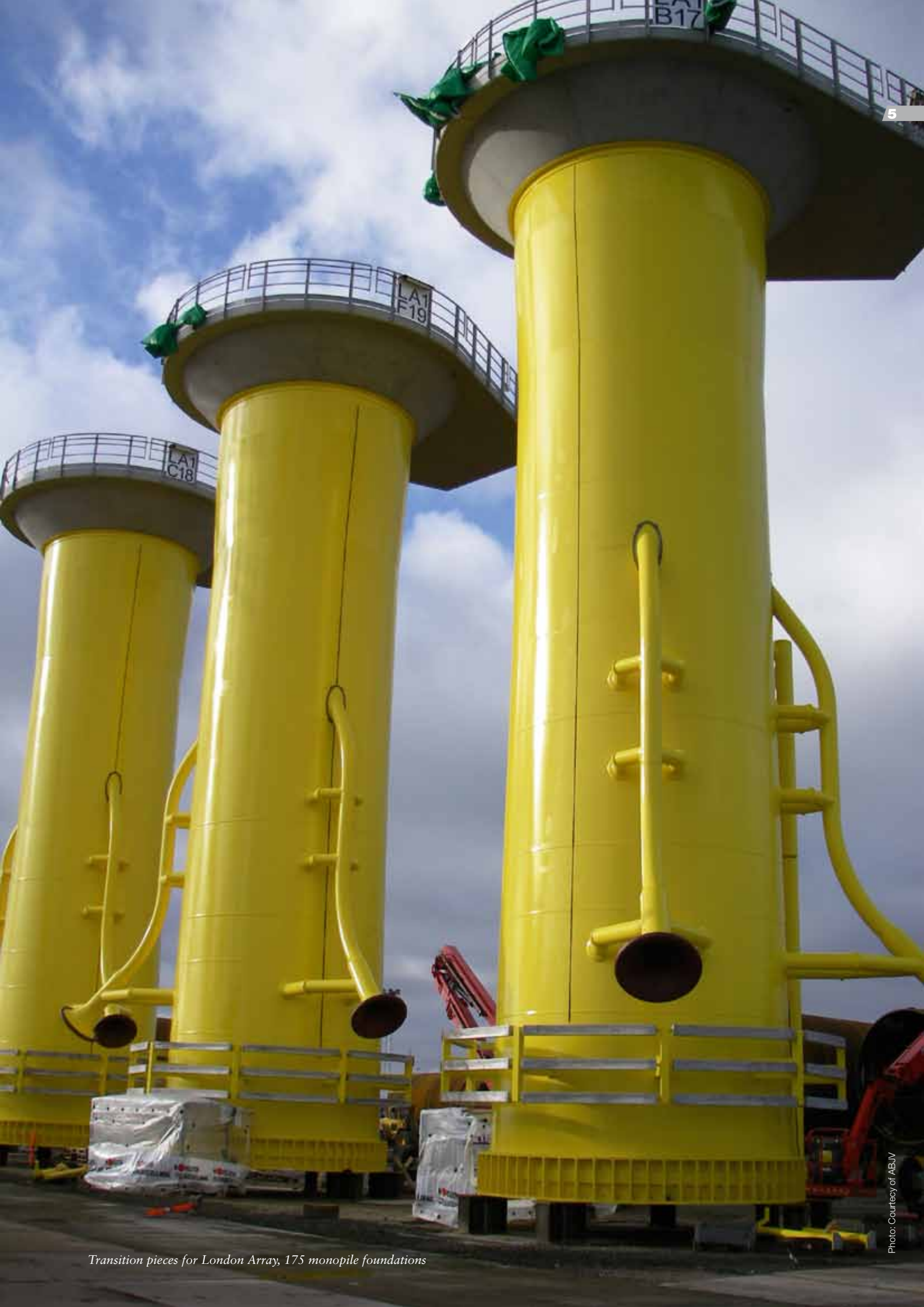
Transition pieces for London Array, 175 monopile foundations