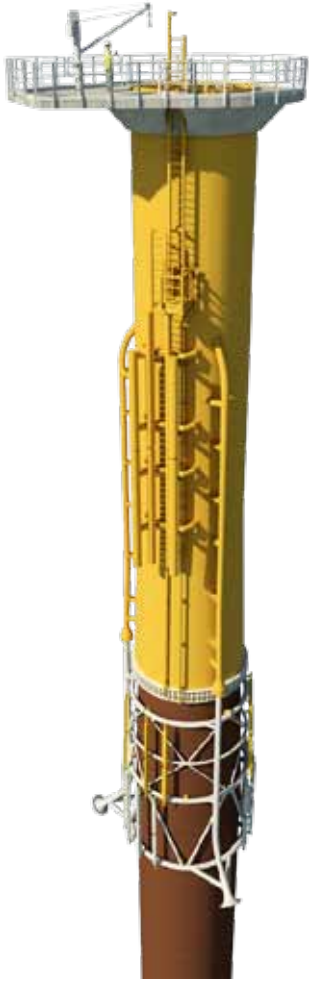
London Array 630 MW, 175 foundations