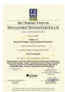
DS/EN ISO 9001 certificate

COWI is a leading international consulting firm. We provide state-of-the-art services within the fields of engineering, environmental science and economics.