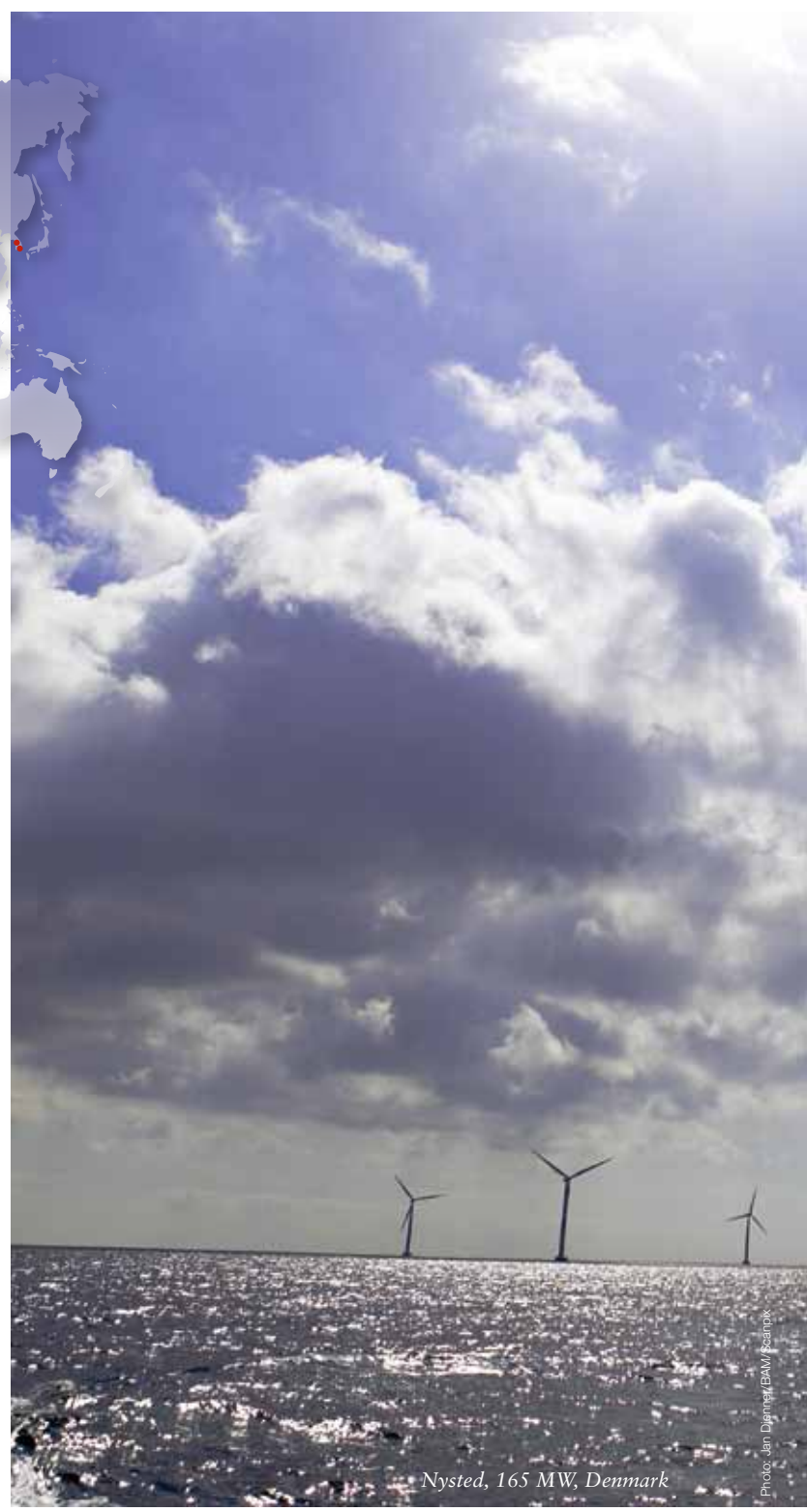
Nysted, 165 MW, Denmark

With offices and 6,000 employees all over the world, we offer consultancy services and plan projects using our extensive knowledge of local markets while drawing on the international experience of our entire organisation.