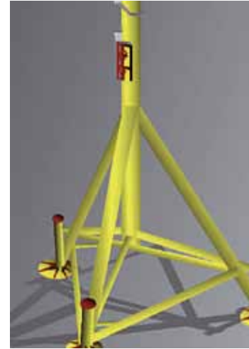
STAR jacket, owner: Maersk Oil

Cathodic protection of the foundation structure may also be required.