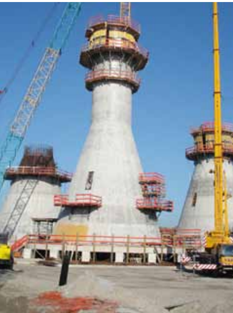
Thornton Bank, foundation for 5 MW WTG

We conduct installation studies taking the permissible weather windows into account and we provide the client with a basis for optimising his installation requirements.