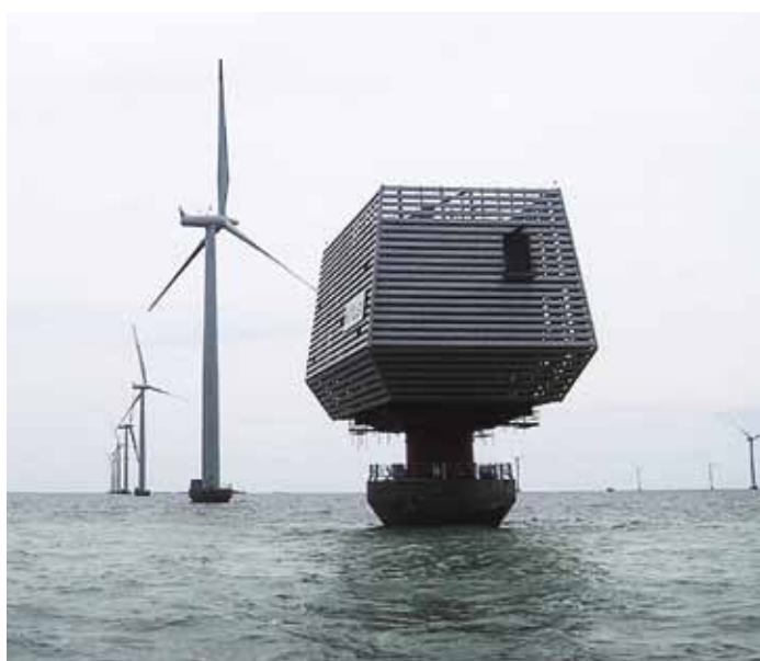
Transformer platform and foundation design, Nysted